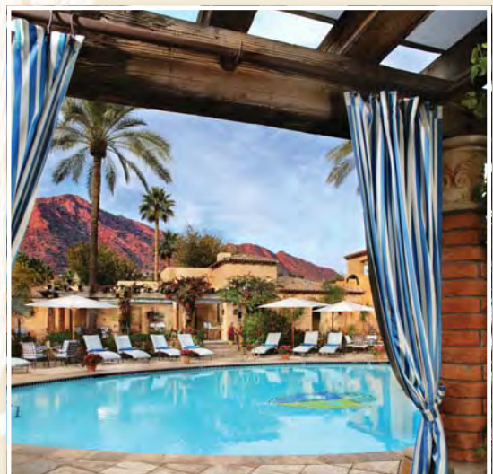
Take a quick dip in the pool for a refreshing break before dinner.