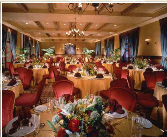
T. Cook's has received the highest ratings from both national food critics and locals for its select seasonal dishes.