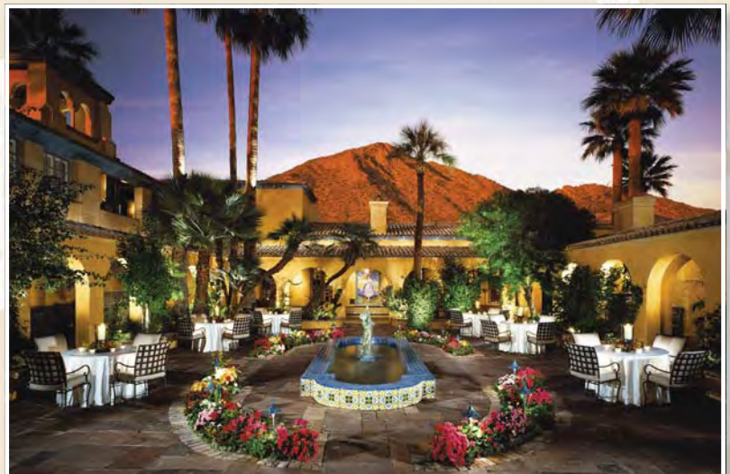
Enjoy the gorgeous views of Camelback Mountain.

The Royal Palms Resort and Spa is located at the base of Camelback Mountain in Phoenix, only seven miles from Phoenix Sky Harbor International Airport and centrally located just moments from downtown Scottsdale.