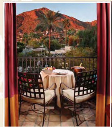
There's nothing wrong with taking a little time for yourself.