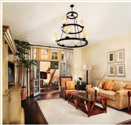
For 2 nights, you will get a sense of comfort and history in rooms found at The Royal Palms.

After a busy day of learning you will be thankful for the comfort of your Royal Palms room. An array of guestrooms feature terraces, courtyards, luxurious spa amenities, fireplaces and romantic appointments especially tailored with you in mind. Each evening, a celebration of champagne and a serenade of Spanish guitar music grace the Montavista Courtyard as the crimson-colored sun sets upon Camelback Mountain.