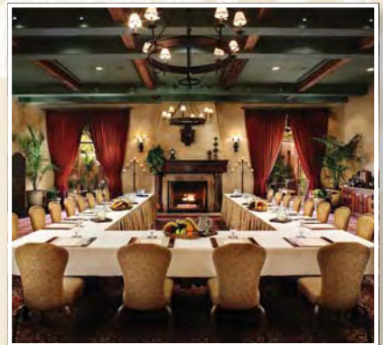
Quaint meeting rooms like this offer a productive, educational setting.

This is not your typical conference location. The resort's meeting salons are rich in design, character, detail and history yet at the same time meeting the needs for today's technology based conferences. Antique furniture, huge stone fireplaces and views of tranquil gardens will make you feel like you are an honored guest of a grand estate.