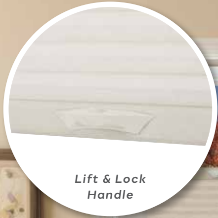
Lift & Lock Handle